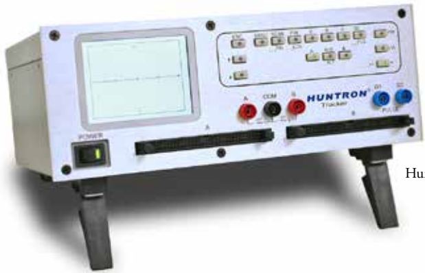
Huntron Tracker 3200S

The NEW Huntron® Tracker® 3200S is designed to encompass our product history and leadership in power-off test by providing powerful test and troubleshooting solutions.