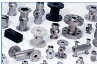
Measuring cells for any application