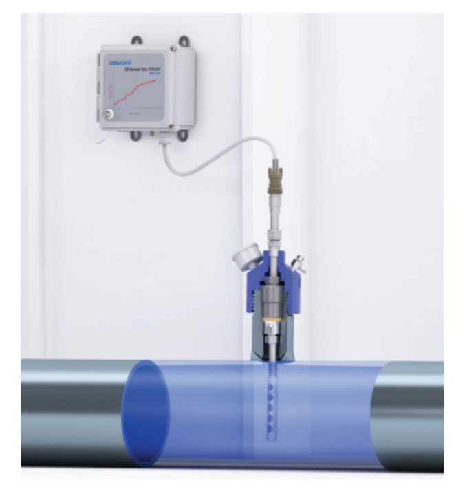
RDC-COT Connected to a High Pressure ER Probe